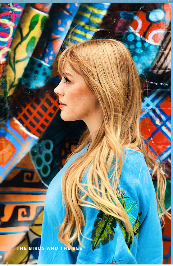
THE BIRDS AND THE BEE